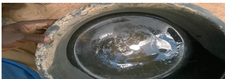
Plate1: Mercury on the Basin to be applied in the gold extraction

Majority; 347/384 (90.4%) of the respondents reported that they used Mercury in the gold extraction process. Of these, 88% reported health problems associate with the use of Mercury. 98% respondents expressed fears regarding the health and ecological implications of mercury use in gold extraction particularly the possibility of food and water pollution. Indeed observation revealed use of large amounts of mercury in the gold extractions. Besides, the mining sites were close to the water sources which accounted for 99% of water requirements for domestic use putting the health of the miners and the surrounding communities at a great health risk.