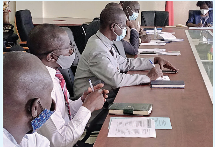
The Members of the University Management during a Press Conference held on Wednesday 25th August 2021 at the Council Hall in the run-up to the graduation ceremony.