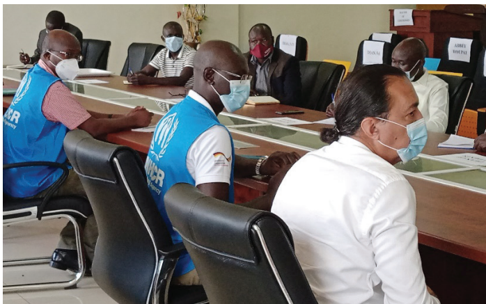
Officials from UNHCR, Yumbe District Local Government and Muni University discussing plans for the establishment of a soap factory at a meeting held at the University Council Hall on Tuesday, 31 August 2021.