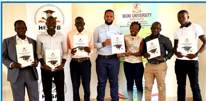
Some of the Loan Scheme Beneficiaries took off their face masks for a few minutes after signing into the Scheme at the University main campus

The loans are intended to increase equitable access to Technical and Higher education and support highly qualified Ugandan students who may not afford Higher Education