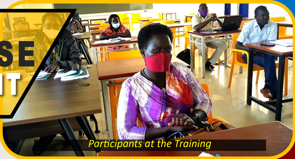
Participants at the Training

The Stanbic Business Incubator carried out a 5 day enterprise development training at Muni University Business Incubation Center aimed at enhancing local Small and Medium Sized Entrepreneur's (SMEs) capacities and promoting business resilience and sustainability.