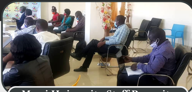
Muni University Staff Recruits

M uni University family is expanding! At least 30 staff have been recruited in the month of November 2020 bringing the total number of staff to 204.