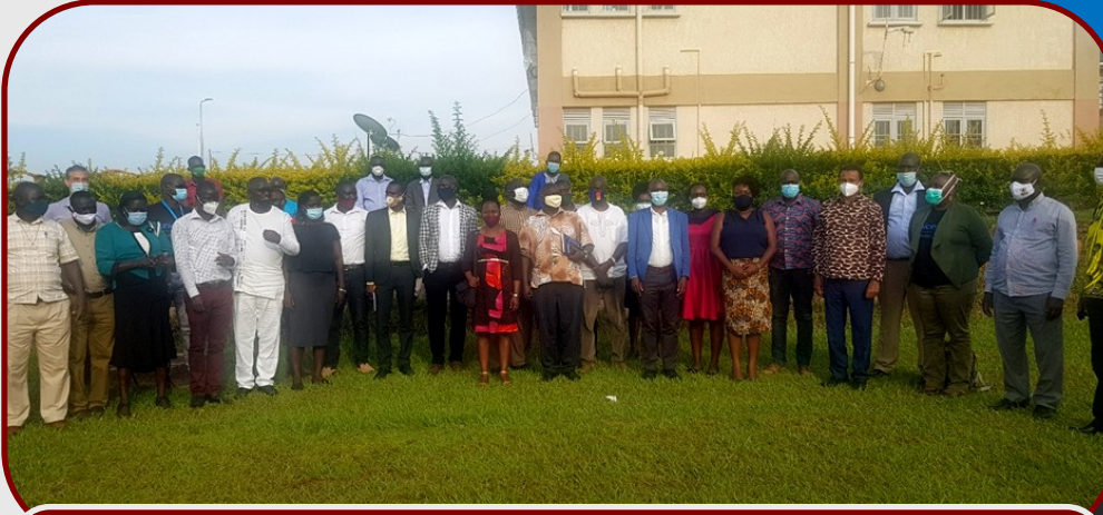
Participants in the meeting pose for a group photo