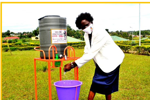
VC demonstrates how the hand-washing tap is used