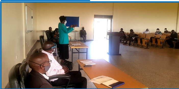
VC addresses Finalists during Orientation

She advised the Students to focus on completing their studies successfully and protect each other and the community if they are to achieve their goals.