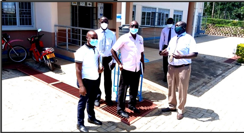
DVC (Right) interacts with the Team from NCHE in front of the University Library.

A team from National Council for Higher Education (NCHE) were in Muni University on Wednesday 28th Oct 2020, to establish the readiness of the university in reopening for students. They checked whether the SOPs were adhered to and were very happy about the compliance level of the university to the SOPs.