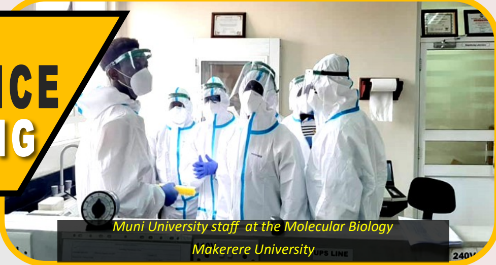
Muni University staff at the Molecular Biology