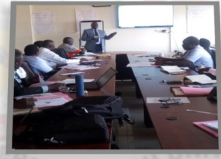
Midterm Strategic Plan Review Workshop