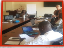
Bachelor of Nursing Science Curriculum Reviewed