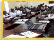
40 New Staff Recruited