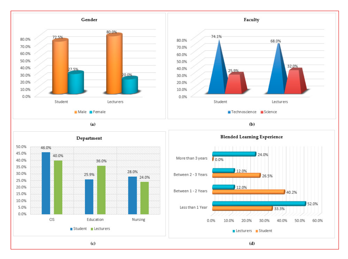
Figure 1. Respondents' social demography characteristic i.e. (a) Gender d; (b) Facilities; (c) Departments; (d) Blended learning experience.