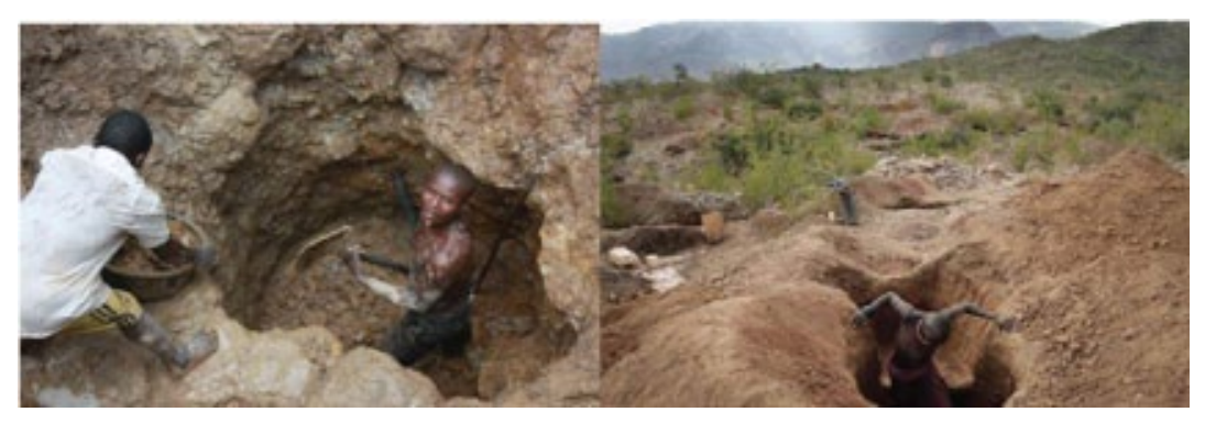
Plate 3: Mine collapses are common place. Such mining pits have high chances of caving in and killing miners.