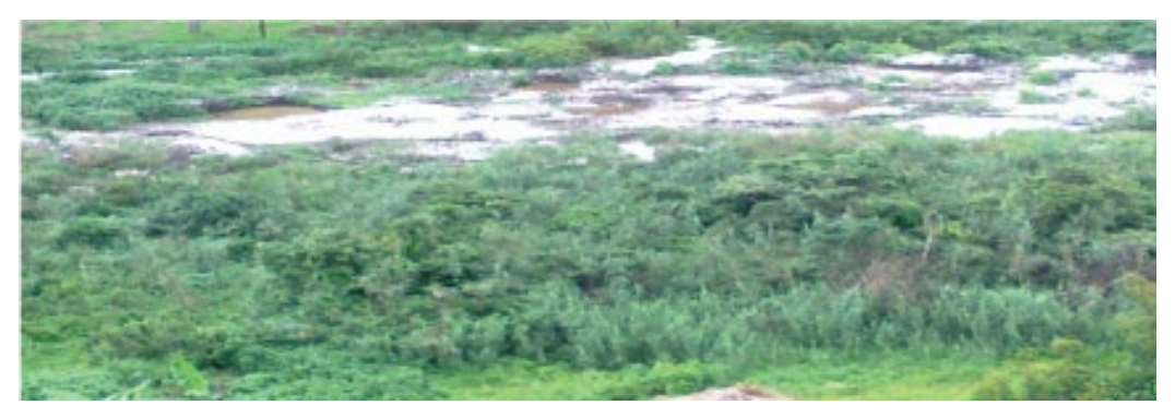
Plate 1: Degradation resulting from artisanal gold mining operations

The former agricultural land that was put under mining is now heavily degraded due to poor mining practices (plate 1). Most of this land is part of the fragile wetland ecosystems which provides water sources of domestic and livestock use. As a result, the hydrological, ecological and social economic value of the land has been lost resulting into drying up of animal watering points and springs. Majority of the households that still undertake agricultural activities now have concerns with the source of water for the livestock and other activities and this increases the cost of managing the farming business as well as the cost of water for domestic use. A 20 Litre jerican of water is sold at 1000Uqx in the mining camp.