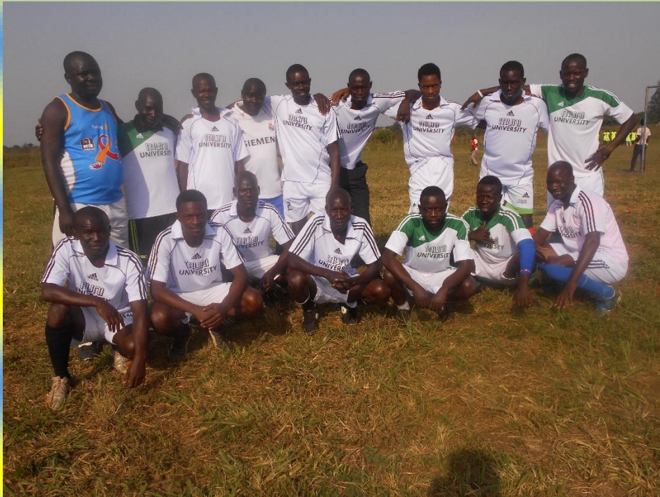
Figure 5 Muni University Football team pose for a group photo before a friendly match with ADRAA Agricultural Institute. The match ended 1-1